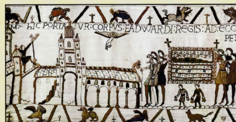
Bayeux Tapestry Funeral Procession ca 1070-1080