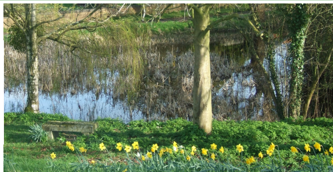
Springtime at the Village Pond, captured by Sue W - worth a walk... daffodils, primroses, violets and grape hyacinths!